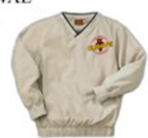
JP 54 Competitor Jacket (Lightweight alternative to the Challenger jacket)